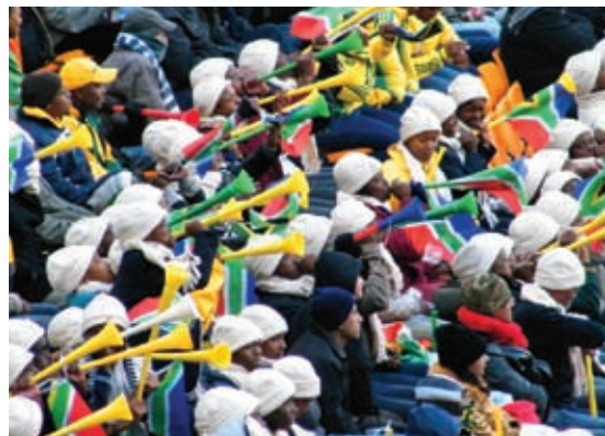
Supporters blowing vuvuzelas during a 2010 World Cup match.

the noise is potentially troublesome. Such noise can be annoying to others and potentially damaging to listeners. Hearing protection (ear muffs or ear inserts) should be worn while using loud equipment such as lawn movers, tractors, leaf blowers, etc. Due to longer periods of use, iPods and MP3 players can be hazardous. When nonusers can hear the sound of music while standing next to someone using an iPod or MP3 player, it is clear that the volume is in the “danger zone” of sound exposure.